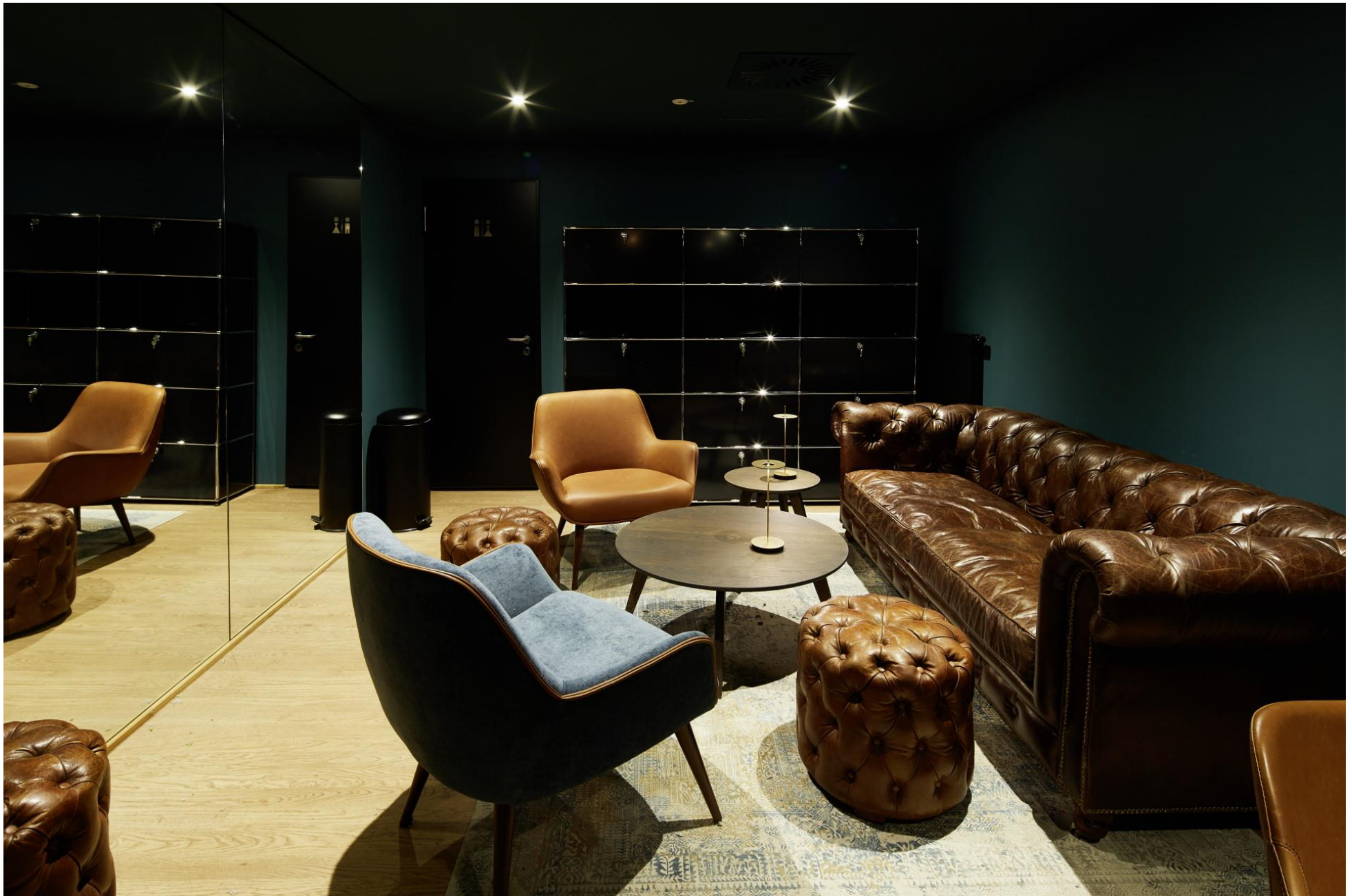
5 - Backstage Raum mit Schließfächern und eigener Toilette – keine Dusche – im vorderen Bereich zusätzlich ein großer Tisch + Stühle