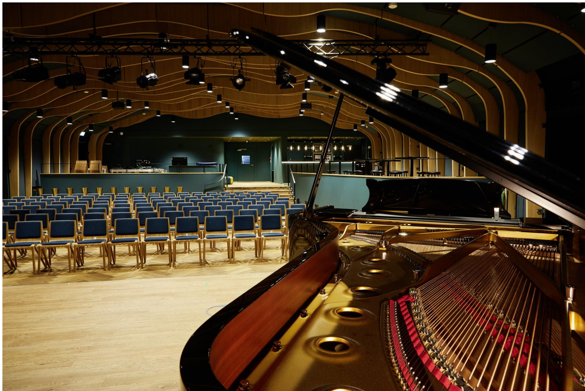
1 - Blick von der Bühne (mit Steinway D) in den Saal