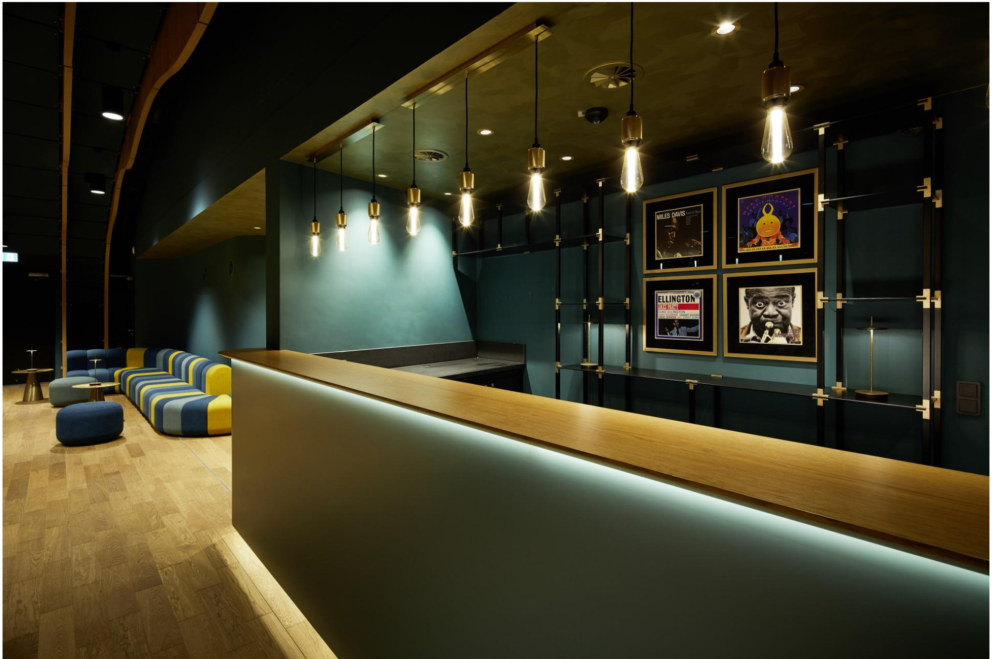
3 - Bar by Cornelia Poletto