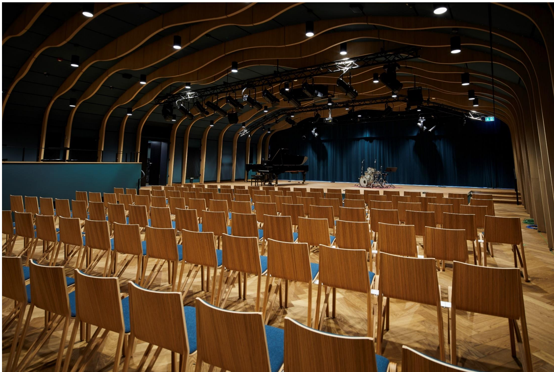
2 - Blick vom Parkett auf die Bühne – mit regulärer Konzertbestuhlung