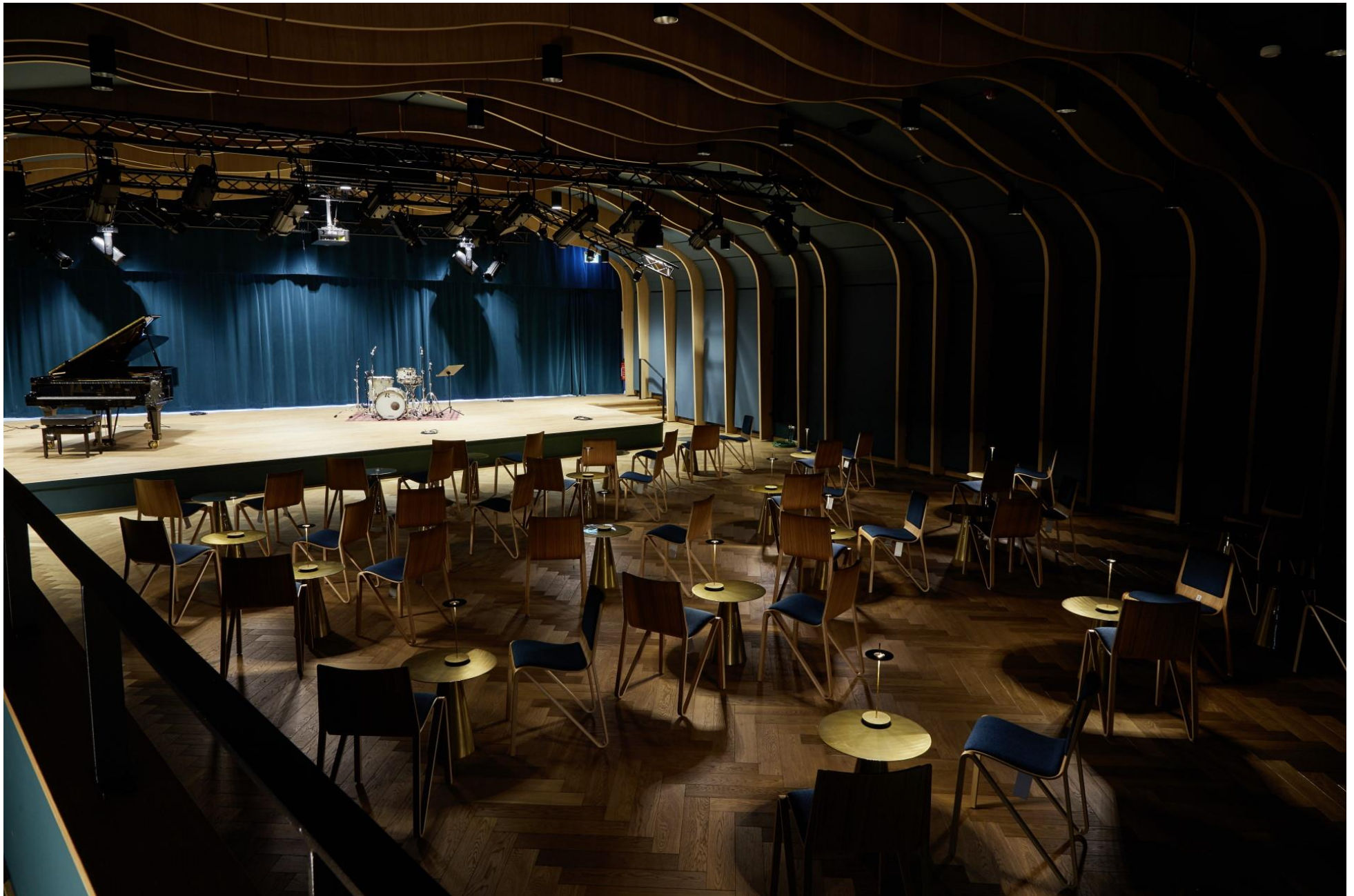
4 - Blick vom Rang Links in den Saal - mit alternativer Bestuhlung